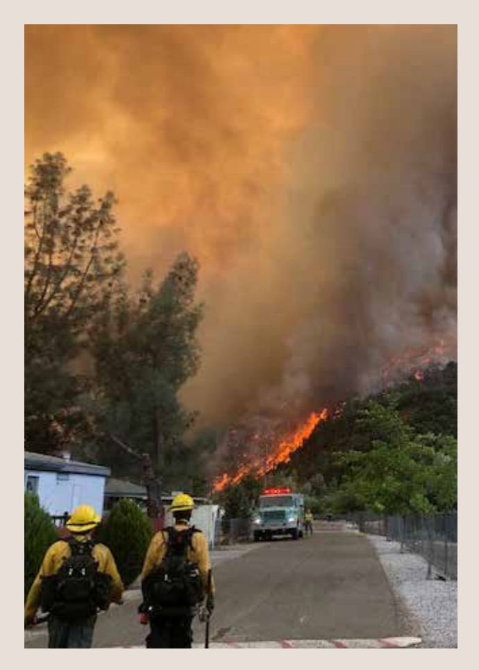
Shasta-Trinity National Forest, CA, engine crew patrol for spot fires adjacent to structures during the initial attack of the Carr Fire.

Even though making progress on substance is critical and is the primary reason for collaboration, having a laser focus only on it and ignoring the other forms of progress is risky. The Progress Triangle's shape reinforces the essential nature of relationships and processes in achieving meaningful progress on substance—they are the foundation upon which meaningful progress on the substantive issues is built.