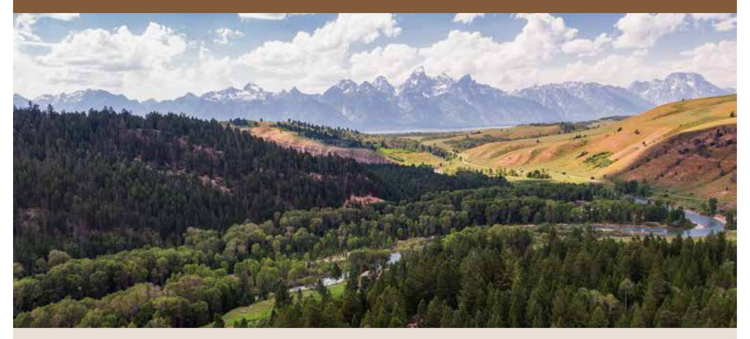
Located in western Wyoming, the Bridger-Teton offers more than 3.4 million acres of public land for your outdoor recreation enjoyment.