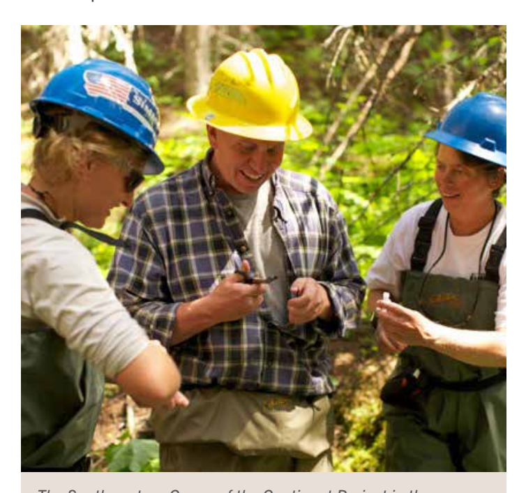
The Southwestern Crown of the Continent Project in the Helena-Lewis and Clark, Flathead, and Lolo National Forests, MT. Photo of trout genetic sampling on a tributary of Beaver Creek.

Seek a participant mix that includes a broad diversity of the relevant stakeholders; encourage reluctant yet relevant parties.